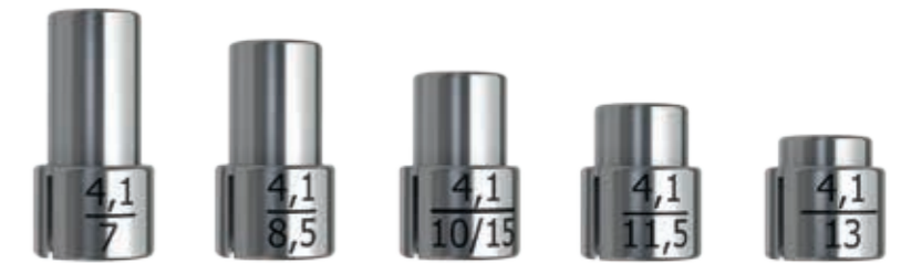
Drill stops for depth drill S 4.1 Art. No. 55715