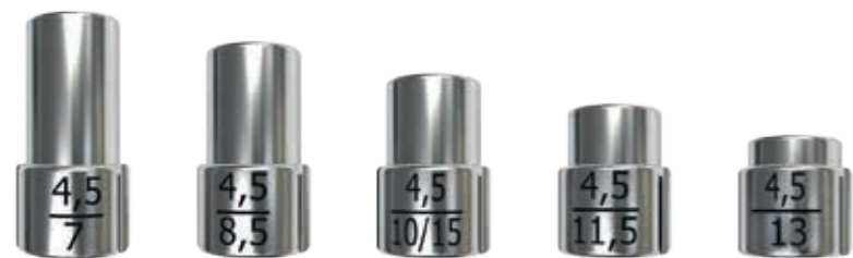
Drillstops für Tiefenbohrer S 4,5 Art.-Nr. 55810