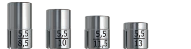
Drill stops for depth drill S 5.5 Art. No. 55910