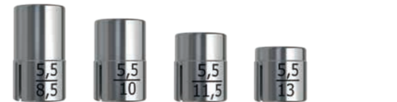
Drillstops für Tiefenbohrer S 5,5 Art.-Nr. 55910