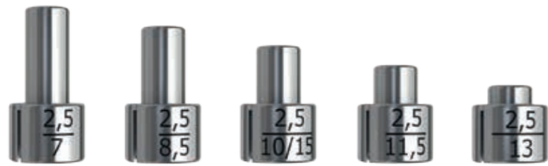
Drillstops für Tiefenbohrer 2,5 und S 3,25-3,75 Art.-Nr. 55804