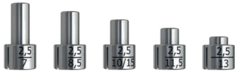
Drill stops for depth drill 2.5 and S 3.25-3.75 Art. No. 55804