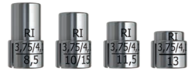
Drillstops für Tiefenbohrer RI 3,75-4,1 Art.-Nr. 57608