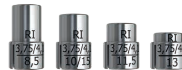
Drill stops for depth drill RI 3.75-4.1 Art. No. 57608