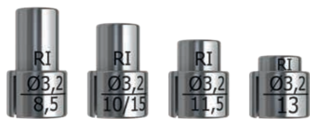
Drill stops for depth drill RI 3.2 Art. No. 57607