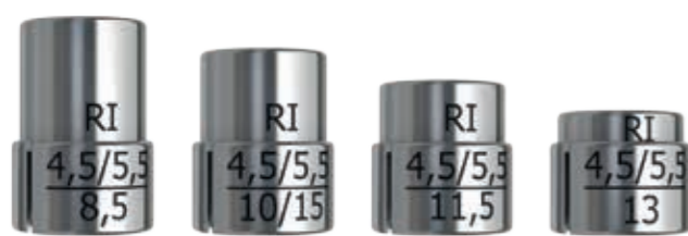
Drill stops for depth drill RI 4.5-5.5 Art. No. 57609