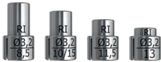
Drillstops für Tiefenbohrer RI 3,2 Art.-Nr. 57607