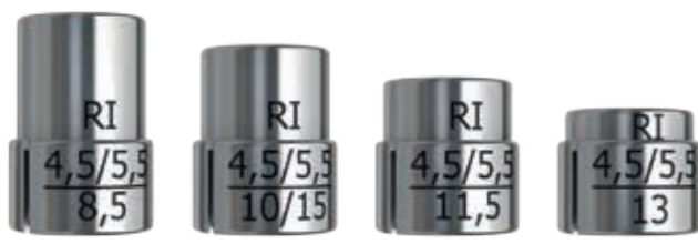
Drillstops für Tiefenbohrer RI 4,5-5,5 Art.-Nr. 57609